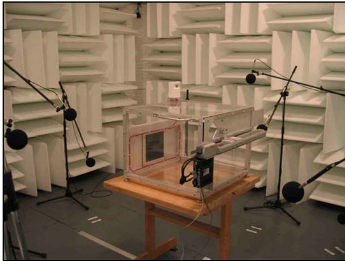
Figure 2: Photo of 1/2 size plenum prototype in Acoustic Systems hemi-anechoic chamber

The plenum is currently being put into use in the NASA Glenn Research Center Acoustical Testing Laboratory and will be used to characterize both air moving device performance under aerodynamic load and the effect that inlet and outlet conditions have on noise emissions from these devices. Future work will include development of software to automatically move fans through a variety of operating conditions, and integration with the existing acoustic data acquisition system to create a system for fully automated fan characterization. Fan mounting plates consistent with the requirements of ANSI S12.11-Part 2 6 for vibration measurements are also being developed and will be integrated into the data acquisition system.